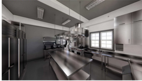
DINING ROOM DOOR, CORNER