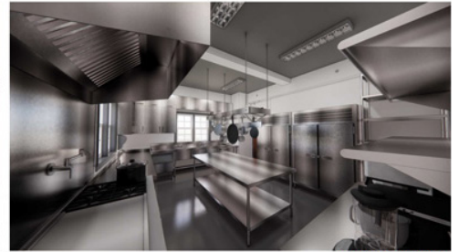
OUTSIDE DOOR, CORNER