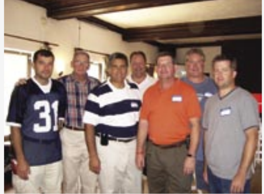
A Reason to be Proud Leadership Committee

Read the story on page 1 for full details.