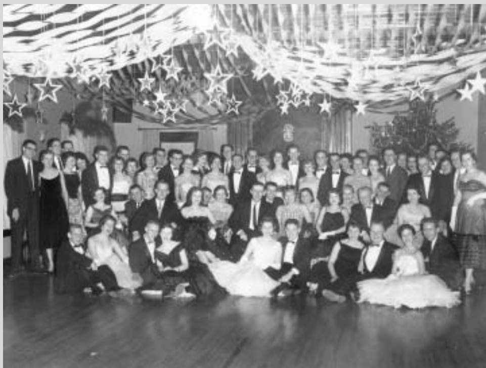
Mill Ball, Fall 1957 ... Where Are They Now?

The current actives have just completed a successful rush with 20 new pledges. They finished the spring '03 semester with a 3.0 house GPA. They continue to have other bonding activities in the building of a homecoming float, actively participating in the Dance Marathon, and continuing our own Super Stars tradition. THEY ARE WORTHY OF OUR CONTINUED SUPPORT AS THEY GAIN CONFIDENCE BY ASSUMING LEADERSHIP ROLES. ■