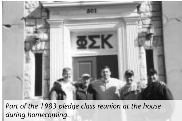
Part of the 1983 pledge class reunion at the house during homecoming.

Remember we will be there for Blue-White game and again for Homecoming 2004. With your interest and support, it will continue. Watch our lifeline for information — newsletters, e-letters, Web site, etc. Please support them so we can continue to serve the ever-growing throng. This doesn't happen just in State College; it can happen anywhere that two or more can get together in local areas as we do in the D.C./Baltimore area each January. ■