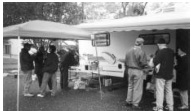
Alumni enjoying the postgame tailgate at homecoming.

We really need a reserved R.V. space closer to the stadium. It would greatly improve our turnout!