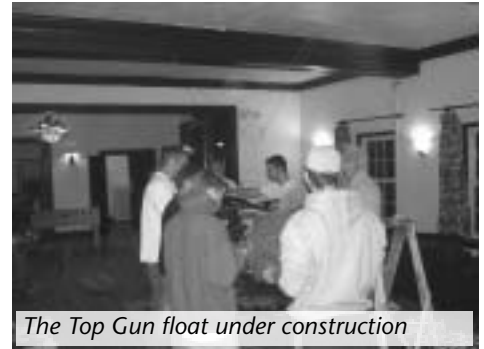
The Top Gun float under construction

With only eight weeks left in the semester, we look forward to canning trips to raise money for the Dance MaraTHON and Superstars, both held in the spring. As president, I am thrilled to lead such a great group of guys this semester, and I can say that we are headed in a fantastic direction. I can honestly say there is a buzz around this house that hasn't been felt for years. Damn Proud! ■