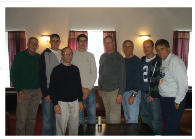
Board members and actives at Homecoming.

This was a great event and alumni were warmly welcomed by the actives. Founders' Day, to be held in late March or early April, will give alumni another opportunity to rekindle old friendships and meet new brothers. Stay tuned for Founder's Day information (to be posted at <a href="www.phisigpsu.com">www.phisigpsu.com</a>) and plan to visit the "new" Kappa Chapter house in spring 2010.