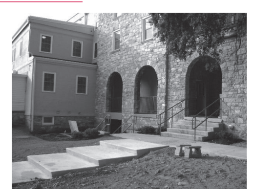
The exterior renovations in the fall. See more great photos of the renovations at www.phisigpsu.com.

Don't forget, if you haven't yet registered on the site you can find your Member ID for First Time Login on the mailing panel of this newsletter.