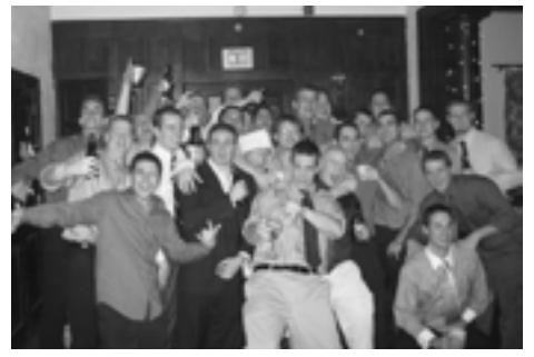
All our undergraduate brothers enjoying the winter formal in December.

Though only six members strong, our current pledge class marks the largest spring