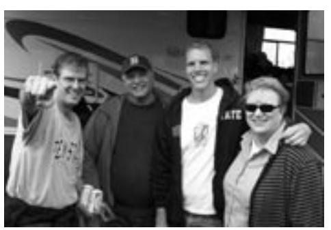
Scenes from the 2005 Blue/White Phi Sig alumni tailgate.

Once again we will gather at the stadium to get the first look at the 2006 Nittany Lions. This event has grown over the past several years