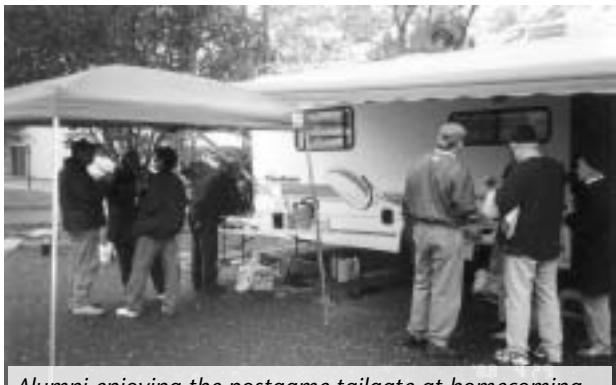
Alumni enjoying the postgame tailgate at homecoming.

We really need a reserved R.V. space closer to the stadium. It would greatly improve our turnout!