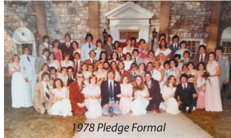
1978 Pledge Formal