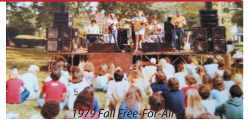
1979 Fall Free-For-All