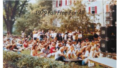
1979 Fall Free-For-All