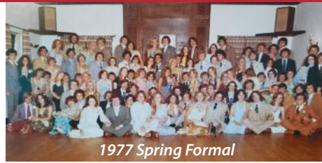
1977 Spring Formal