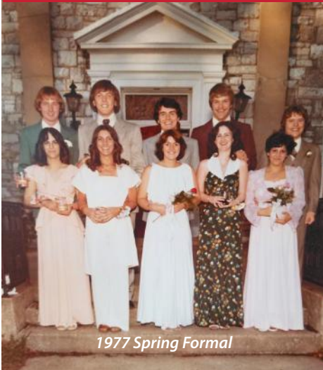
1977 Spring Formal