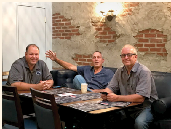
A group of alumni and actives took a break from house projects to enjoy dinner at Letterman's.