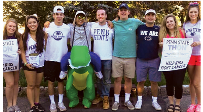
Phi Sig brothers and sorority friends have raised $17,000 so far for THON through canning.

of dollars toward charity causes. A BBQ we held in conjunction with Alpha Xi Delta raised $1,000 for autism awareness, and we also raised $17,000 for THON. We also held a small fundraiser at Chipotle to benefit the Leukemia and Lymphoma Society, and five brothers have participated in Rise Against Hunger. The brotherhood has also assisted the State College Borough in removing invasive plant species