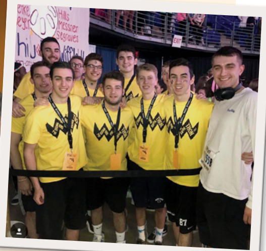
Phi Sig brothers at THON 2017.

Phi Sig brothers aren't just committed to raising money for philanthropy; they're dedicated to raising awareness too. In February, three brothers joined the #cancercannot campaign by shaving their heads for THON—in honor of the pediatric cancer patients that THON benefits.